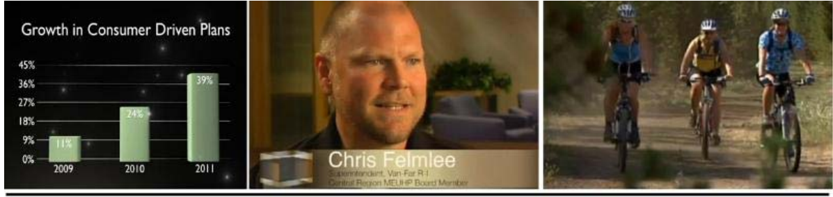
MEUHP - Consumer Driven Health Plans & Health Savings Accounts

MEUHP member districts have been on the forefront of implementing Consumer Driven Health Plans and Health Savings Accounts to help put consumers in charge of controlling health care costs. In this video you'll hear first hand the success stories from MEUHP Board Members, Superintendents and FTJ representatives who educate, encourage healthy lifestyle changes and empower your staff with smart plan choices.