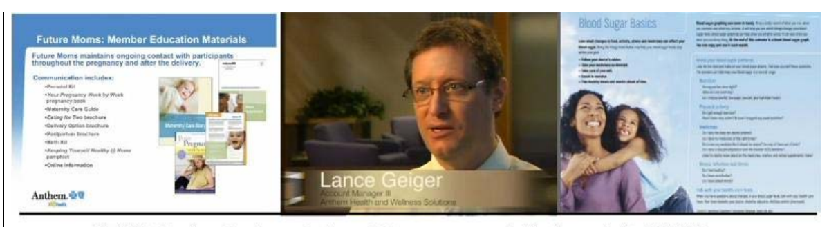
MEUHP Member Services - Anthem 360 programs available through the MEUHP.